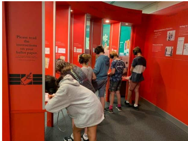
13 - Grade 6 learning about the electoral process