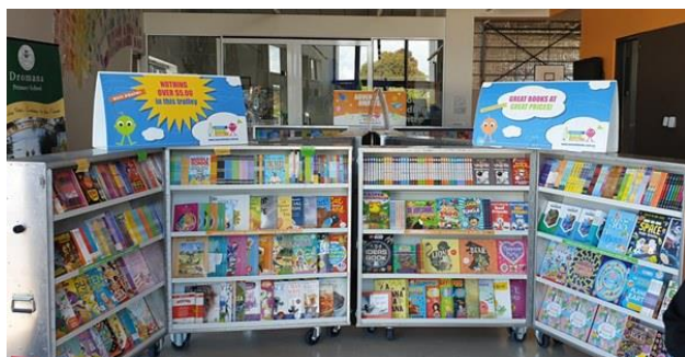
17 - Dromana Primary School 2019 Book Fair