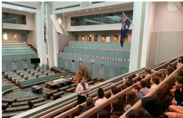
11 - Grade 6 inside Parliament House