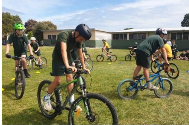
15 - Grade 5 Bike Ed