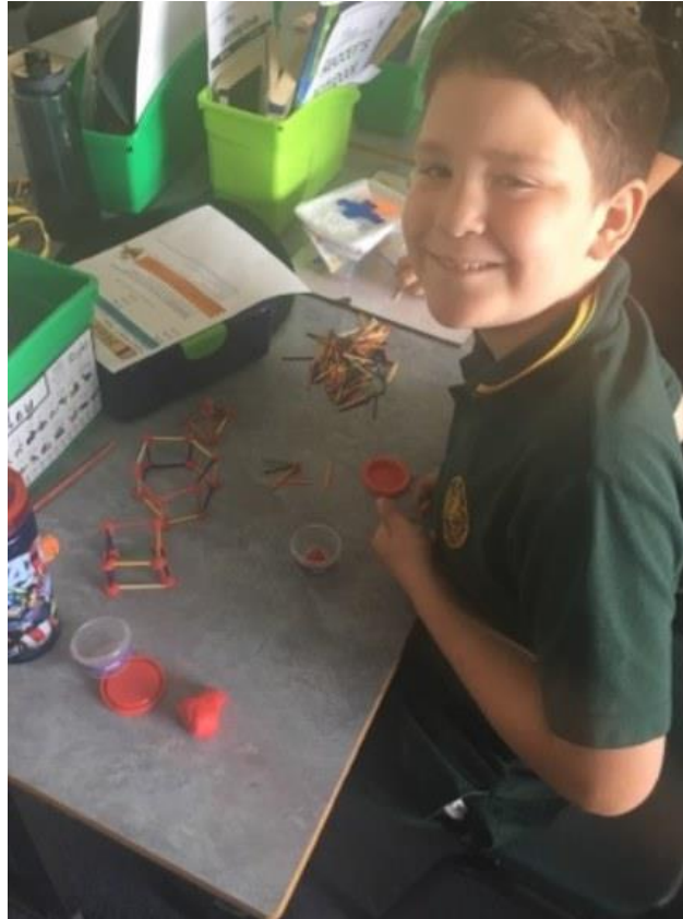
8 - 3D Shapes in Grade 3.