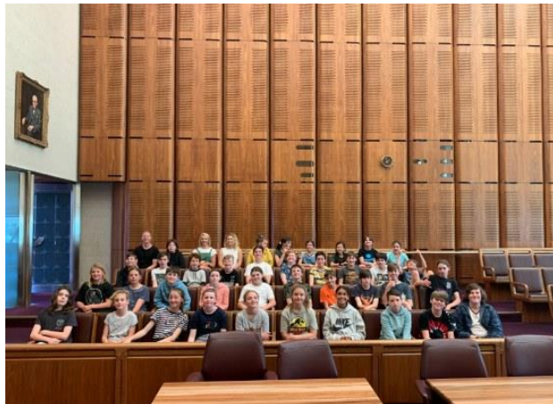
12 - Grade 6 at the High Court of Australia