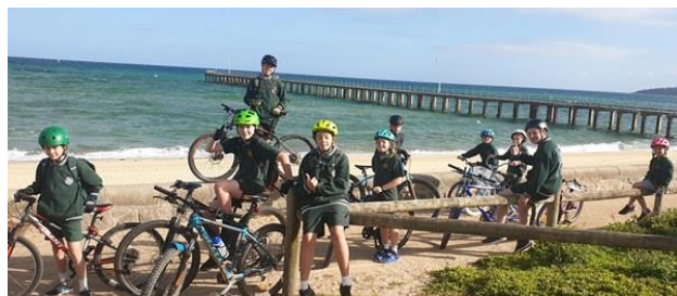
14 - Ride-2-School Team (Wednesday 27th November)

Ride-2-School is on again this week opposite the BP on the border of Safety Beach and Dromana at 8am for a 8:10am departure. Keep up the great riding!