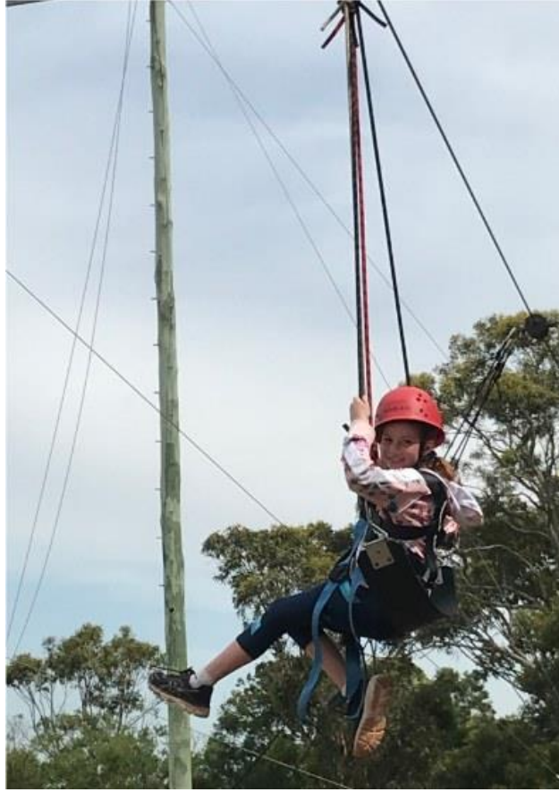
5 - Grade 2 'Big Day Out'