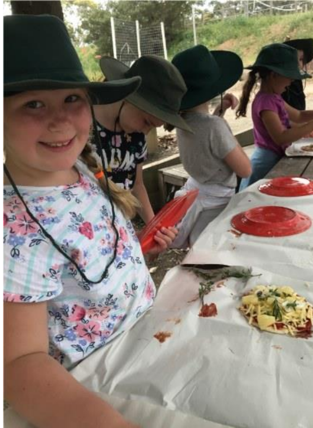
7 - Grade 2 'Big Day Out'