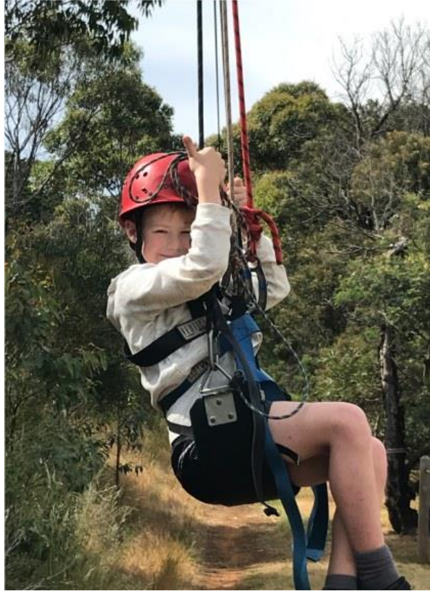
3 - Grade 2 'Big Day Out'