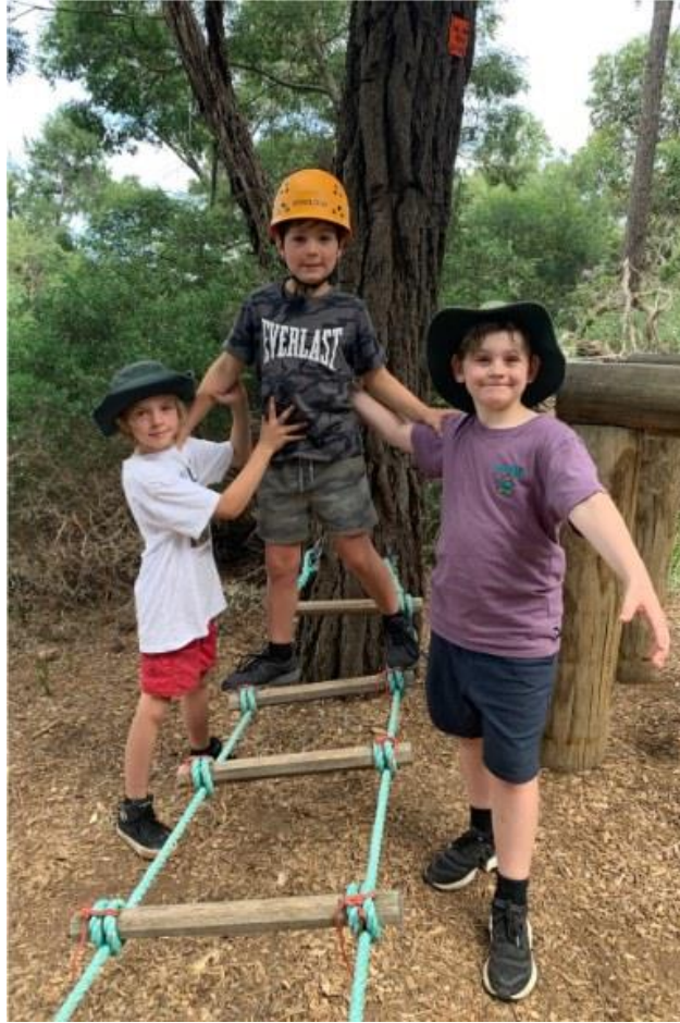
6 - Grade 2 'Big Day Out'