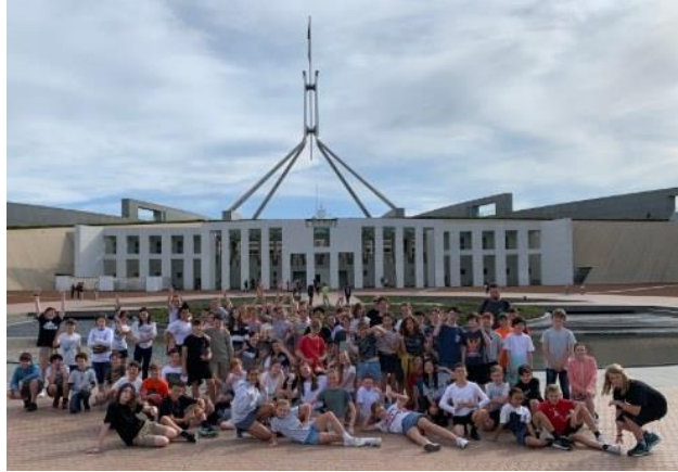
10 - Grade 6 at Parliament House