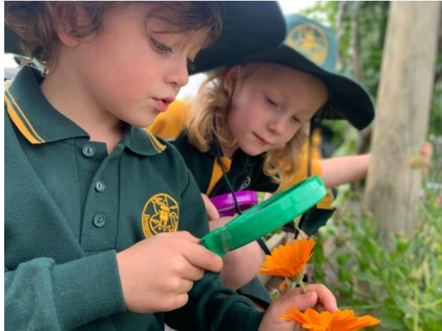
2 - Preps investigating 'Minibeasts' in Science & Aboriginal Studies