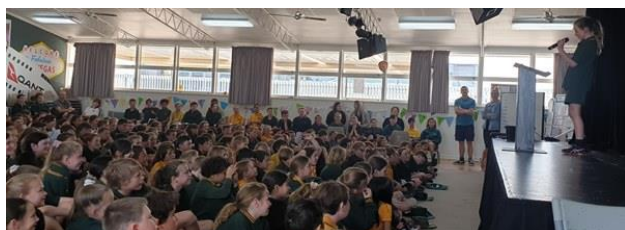
18 - 2020 School Captain Speeches

Congratulations to candidates and students on valuing the process and acknowledging the efforts from all on the day.