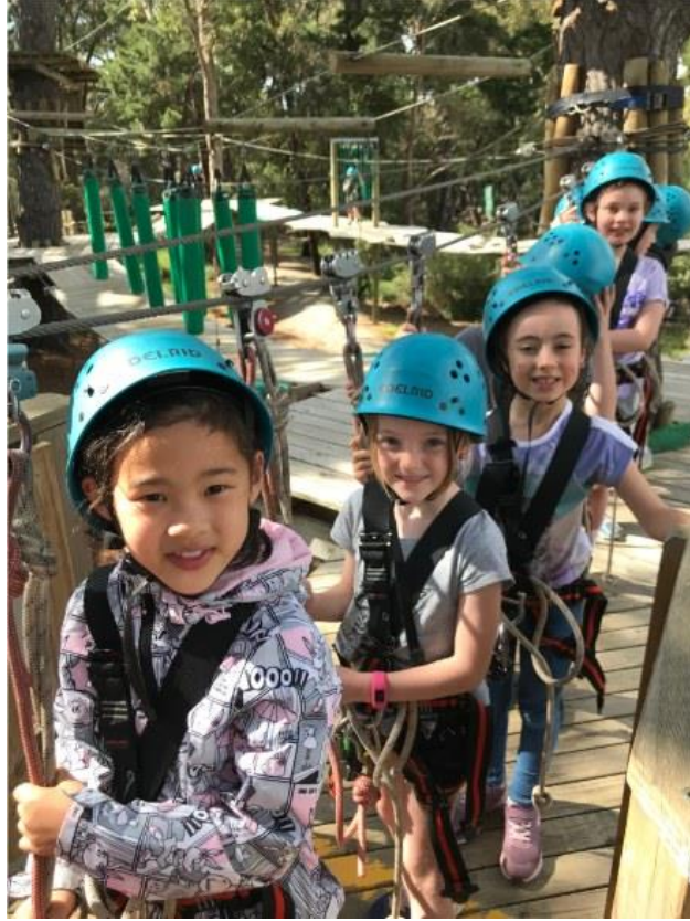
4 - Grade 2 'Big Day Out'