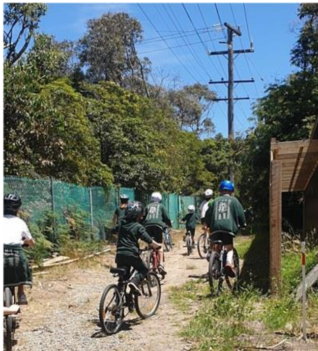
16 - Lunchtime Bike Club - 'on the trail'