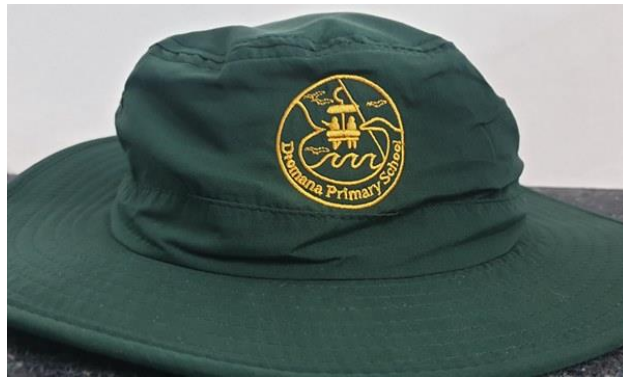
1 - New hat donations for Dromana Primary students.

Our uniform supplier Beleza has very kindly donated a hat to every student in the school. The hats are a new variety, softer fabric and no chin toggle. The hats will be tested for size when students meet their new teacher on Tuesday 10th December. If a specific hat size is not available, we will exchange ready for the 2020 school year.